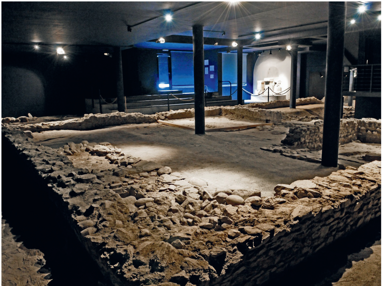
Fig. 1 Excavation of the mithraeum at Martigny (VS).

There is little information about the polytheistic cults celebrated in the late antique Alpine region. Speaking of the representations of the divine in Late Antiquity as part of the history of the sacred in Cisalpine Gaul, Silvia Giorcelli Bersani aptly stressed that archaeological traces are too few to draw a map of the sacred areas. 36 Some studies have collected available sources and organised them on a