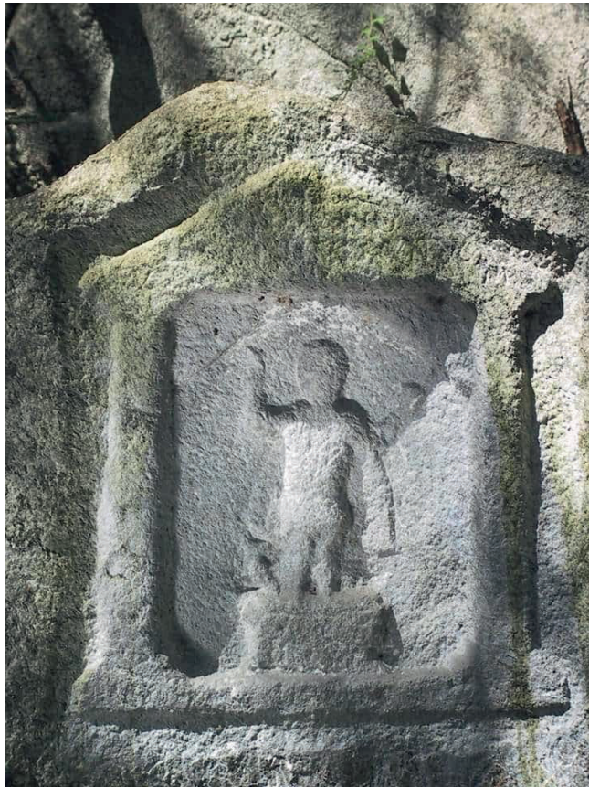
Fig. 3 Relief of the Roman forest god Silvanus located in the vicinity of Turin, on the Val di Susa that connected the city with the Alps. Second century CE.

refined metropolis of Antioch. At least according to the account given by Libanius in his oration Pro templis , it would seem that the countryside was more subject to forced Christianisation perhaps because it was less subject to the control of the city authorities. 97