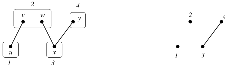
Fig. 1. A clustered graph (G, \mathcal{V}) , on the left, and its auxiliary graph G/\mathcal{V} , on the right.

One can recognize if a given matrix M is the stable set–vertex matrix of some graph, i.e., if M is conformal, in a time polynomial in the size of the matrix (see e.g. [10]). By Theorem 2.3 below, we can decide if the stable set–vertex matrix of a given graph is perfect or not in time polynomial in the size of the graph.