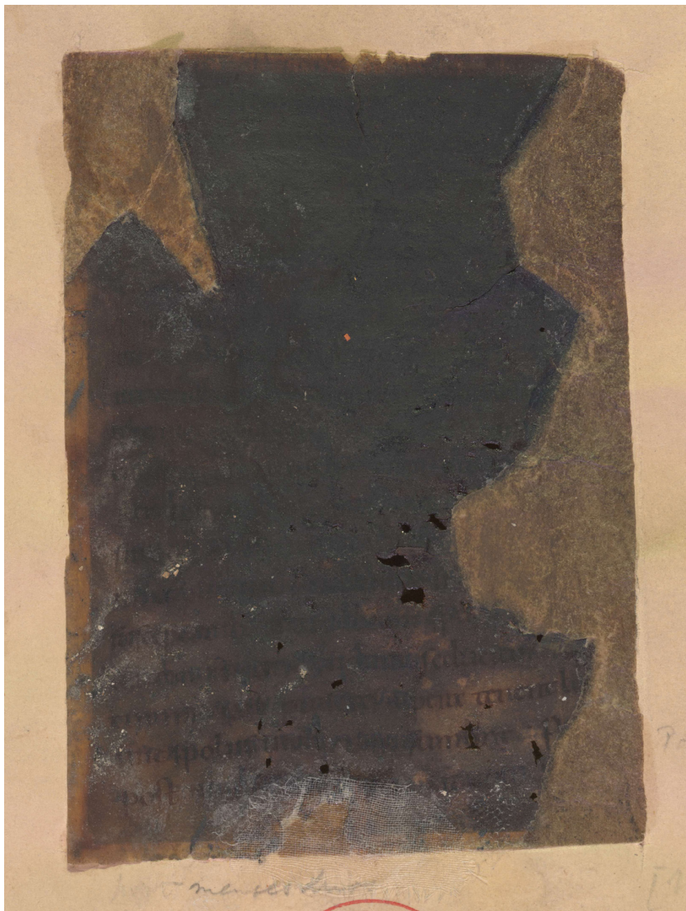
Figure 3: Cotton MS Otho A XII, f. 1r, 2017 under standard lighting