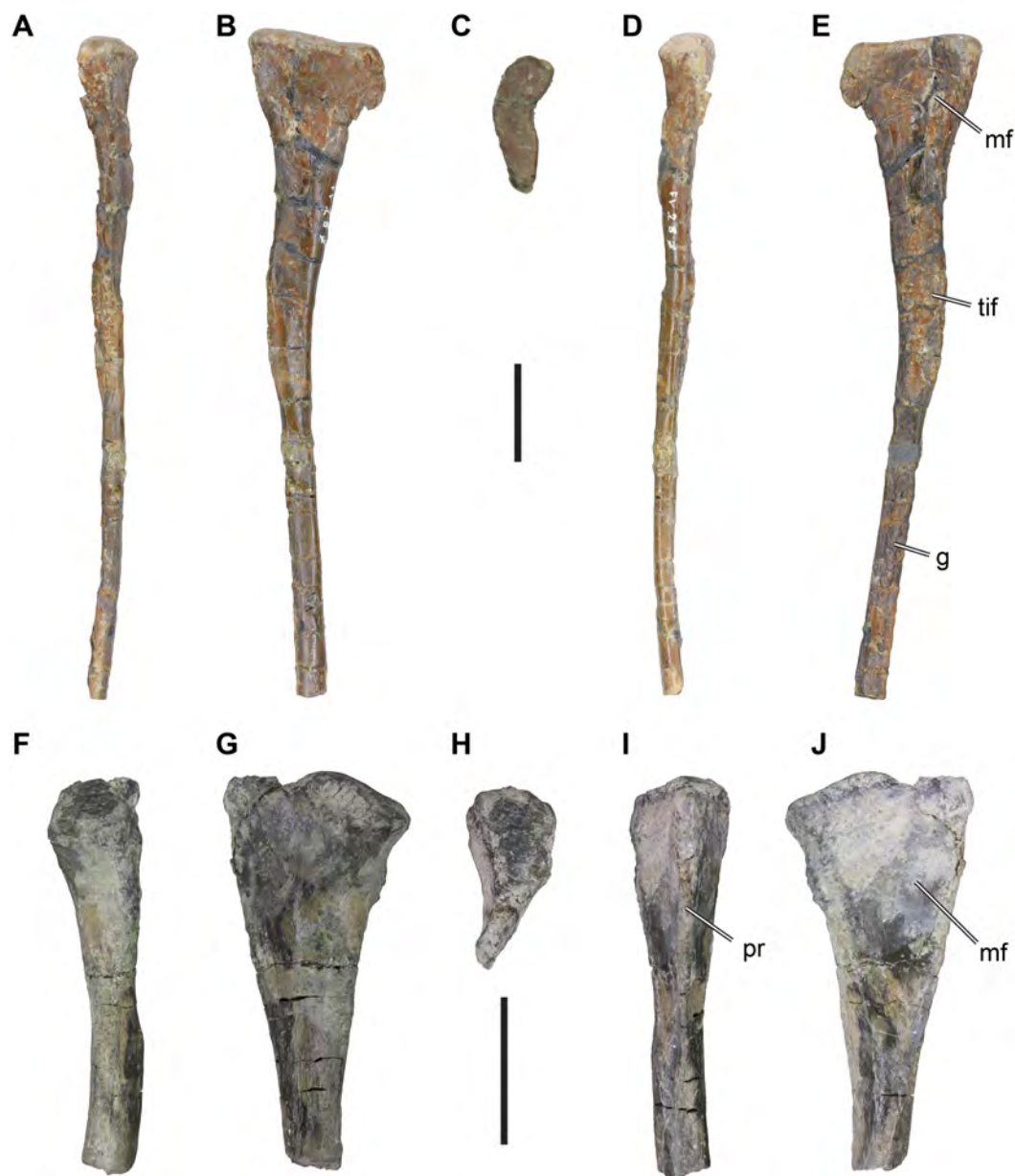
Figure 4 Isolated theropodan fibulae from the Langenberg Quarry. DfMMh/FV/287, left fibula in (A) anterior view, (B) medial view, (C) proximal view, (D) posterior view, (E) medial view. DfMMh/FV3/19, partial right fibula in (F) anterior view, (G) lateral view, (H) proximal view, (I) posterior view, (J) medial view. Abbreviations: g, groove; mf, medial fossa; pr, posterior ridge; tif, tubercle for the M. iliofibularis . All scale bars equal 20 mm.