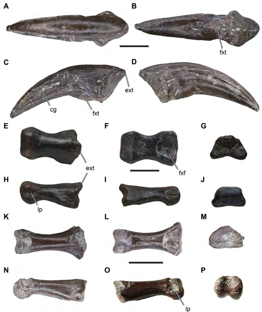
Figure 2 Isolated theropod phalangeal elements from the Langenberg Quarry. DfMMh/FV1/19, pedal ungual, in (A) dorsal view, (B) ventral view, (C) left lateral view, (D) right lateral view. DfMMh/FV/343, pedal phalanx, in (E) dorsal view, (F) ventral view, (G) distal view, (H) left lateral view, (I) right lateral view, (J) distal view. DfMMh/FV2/19, pedal phalanx, in (K) dorsal view, (L) ventral view, (M) distal view, (N) left lateral view, (O) right lateral view, (P) distal view. Abbreviations: cg, collateral groove; ext, extensor tubercle; fxf, flexor fossa; fxt, flexor tubercle; lp, ligament pit. All scale bars equal five mm.