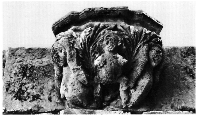
Fig. 9. Bellapais Abbey, Chapter House. Bracket decorated with a man and two syrens, first half of the fourteenth century.

tribution of the building to this Syriac-rite group, even if one is struck by the holy monks' garments, none of them including the decorated koukoulion usually worn in Syria 60 . We know that the Syrian Orthodox possessed several churches in Cyprus, one of them being that of Mar Benham in Famagusta, which seems to have been located on the cathedral parvis 61 ; this does not prevent us from thinking that further cult-places were intended for the same rite, especially if they served as "national" churches for diaspora communities. Nonetheless, a Melkite affiliation cannot be ruled out, especially because of Saint Paraskeve, who seems to have been ignored by the "Jacobites": but one should bear in mind that the West Syrian lectionaries – like that written by the monk Rabban Sliba at the end of the thirteenth century – often appro-