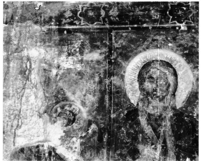
Fig. 8. Famagusta, "Nestorian" church. Fragment of a Virgin of Mercy and Saint Mary Magdalene, first half of the 14th century.

Quite interestingly, the most clearly Italianate fresco in Famagusta is preserved within an Arab Christian church, as the evidence of the Syriac inscriptions points out. The image, though commissioned by Latin patrons and made in a Latin pictorial language, was by sure not intended for Western beholders. A small detail, that of the coat-of-arms displayed on the upper edge, helps us to clear up the mystery: they invariably consist of