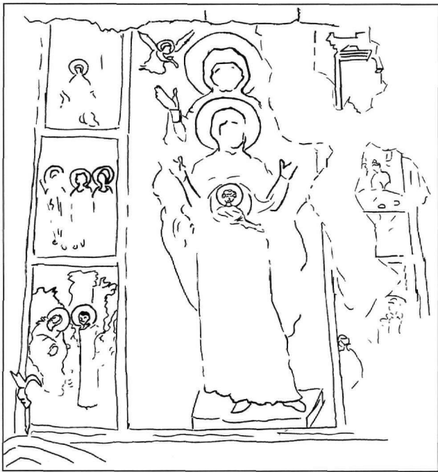
Fig. 4. Famagusta, "Nestorian" church. Sketch of a fresco displaying Saint Anne and the Virgin Mary "Platytera" flanked by six scenes of Mary's Infancy (author's sketch).

conception of Saint Anne by stressing the iconographical analogy of the two figures 28 .