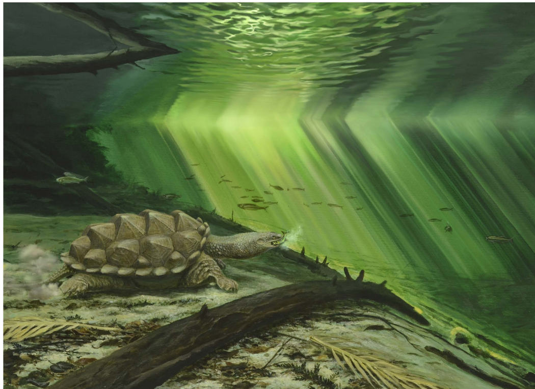
Figure 3. Life reconstruction of Platyechelys oberndorferi in its palaeoenvironment. This reconstruction represents Platyechelys oberndorferi as a fast ram feeder and emphasizes the resemblance of this taxon with the extant matamata ( Chelus fimbriatus ) and snapping turtles ( Chelydra serpentina and Macrochelys temminckii ). Artwork by P. Röschli.

feature of uncertain function that is only known in platychelyids, the matamata, and chelydrids), large hyoids, a relatively wide skull with orbits placed close to the snout tip, and powerful limbs with strong claws. This strongly suggests that P. oberndorferi had a life style very similar to that of the extant matamata and alligator snapping turtle 16 . These turtles are ambush predators living on the bottom of shallow waters where their irregular carapace and skin appendages help them camouflage among vegetation 39 .