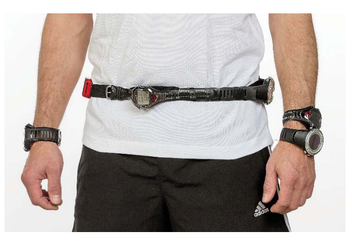
Figure 1 Placement of sport watches and the accelerometer on the wrist and the hip. Order around the hip and location on the wrist (e.g. 2 left / 1 right) was randomised.

three device types (all p -values < .05) compared to the data assessed on the hip (Table 1).