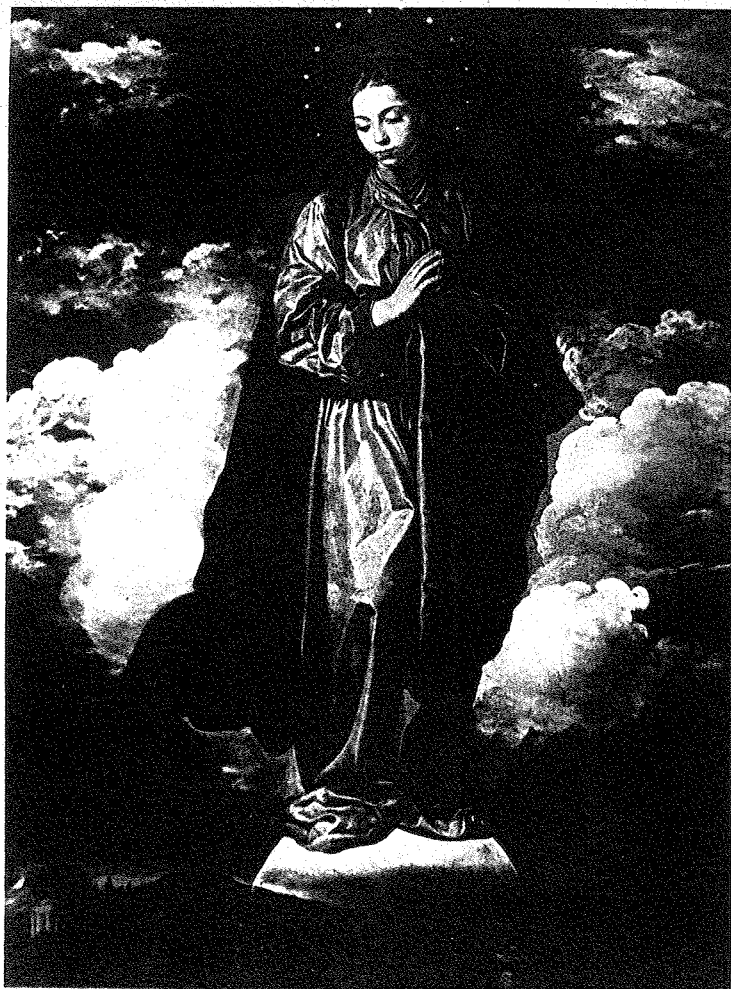
Diego Velázquez, The Virgin of the Immaculate Conception , c. 1620. National Gallery, London

clarification: the Virgin emerges from the clouds surrounding the apocalyptic woman, the "sign" becomes "image." We could even say that with this passage Velázquez monumentally staged the whole problem of the relationship between the apocalyptic vision and the devotional image of the Immaculate Conception. The attentive beholder has the privilege to indirectly watch the making of an image. The "making" takes place in the interstice between the two "volets." The painting of the Immaculate Conception fills up, as it were, the blank page on which Saint John only had time to mark two lines: "A great sign appeared in the