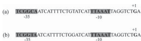
FIG 2 Promoter structures for the tir gene in plasmids pOXA-48a (a) and pNDM-OM (b). The -35 and -10 sequences of the promoter are indicated in boldface type and are shaded in gray. The +1 transcription start sites are indicated in boldface type.

were calculated by using the 2^{-\Delta\Delta CT} method (25). Levels of gap gene (encoding D-glyceraldehyde-3-phosphate dehydrogenase) transcription were used as internal controls to normalize the data. At least three independent RNA samples isolated from three separate cultures were used to determine average transcript levels of each strain.