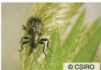
(e) Temnocerus debilis