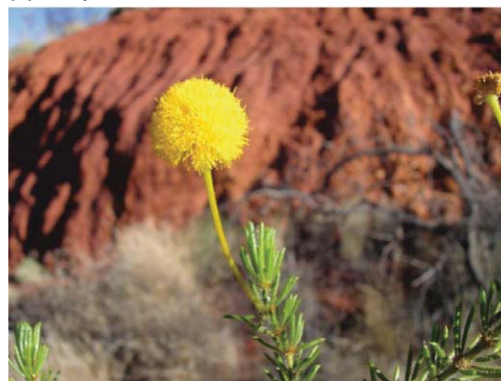
(d) Curry Wattle