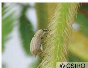
(f) Sibinia fastigiata