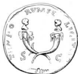
Fig. 2: An aureus commemorating the first twins of Marcus Aurelius (AV, RIC III 48, no. 185; Drawing after A. B. COOK, Zeus , II, Cambridge 1925, 441, fig. 341).