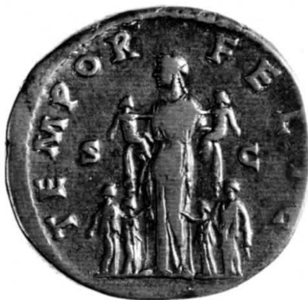
Fig. 4: A coin showing the empress Faustina as Felicitas (AE, sesterce. Avenches, Musée romain M 1944. Photo MRA (Fibbi-Aeppli).

The motif is repeated twelve years later, on 31 August 161, to celebrate the birth of another pair of twins, L. Aurelius Commodus, the future emperor Commodus, and his brother T. Aurelius Fulvus Antoninus. The coin shows the children seated on a throne, crowned with stars (Fig. 3). 19 Another coin shows Faustina as Felicitas standing, surrounded by four girls, carrying the boys, the head sometimes crowned with stars (Fig. 4). 20 The pose of the empress imitates that of the mother of the divine twins, Leto with the small Apollo and Diana (Fig. 5). 21