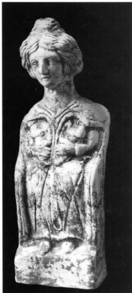
Fig. 7: Gallo-Roman figurine with a mother breastfeeding two babies (Terracotta. Saint-Marcel, Musée d'Argentomagus 74.7.).

The notion of correspondence between breasts and uterus explains the positive reception of twins and the distress caused by other multiple births. Whereas twins meant prosperity, multiple births were synonymous with penury. In Varro, the sow will not be able to feed her supernumerary