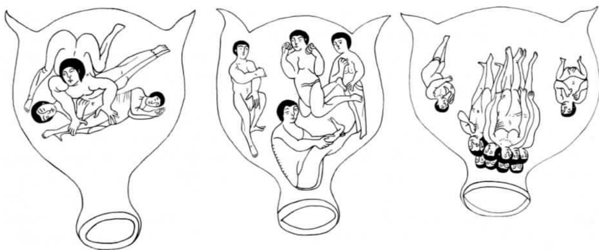
Fig. 6: Cases of difficult labour from a ninth century AD manuscript of Mustio (Author's drawing after the Codex Bruxellensis , Bibliothèque Royale de Belgique, 3714).

In the official discourse, multiple births are welcomed. This favourable attitude mainly concerns triplets, who seem to represent a special case. They have heroic models, the legendary triplets, the Horatii, the champions of Rome against other legendary triplets, the champions of Alba, the Curiatii. Dionysius of Halicarnassus explains that the two sets of triplets were born of twin sisters, the daughters of the Alban Sicinius who married one to the Roman Horatius, the other to the Alban Curiatius; the sisters gave birth to triplets on the same day and the event was greeted as a good omen by both communities. 39 To confer 'immortal honour and glory' on the Horatii, a law 'observed to this day' (first century BC), provided that 'the parents of triplets shall receive from the public treasury the cost of rearing them till they are grown'. 40