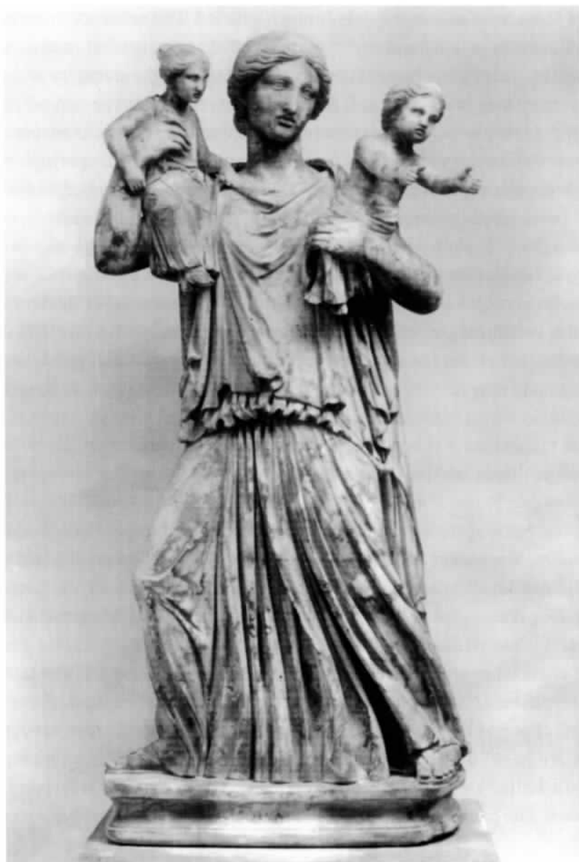
Fig. 5: Leto with the small Apollo and Diana (Marble statuette. Rome, Mus. Torlonia 68. Photo DAI Rome, neg. 34.2003).

Besides the Dioscouroi and Romulus and Remus, other references to mythical twins are found. Commodus was depicted as a new Heracles when he was still a child. In a marble statue he is depicted as a Herakliskos , strangling snakes. The statue was probably made in 166 when Commodus was aged 5. 22 His twin brother Antoninus had died a year before. 23 The allusion to Heracles is